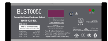
Deluxe Electronic Ballast 110-240V 50/60Hz